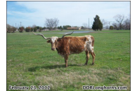
Windwalker FM 50