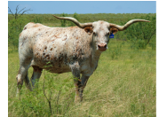
CIRCLE K DONOVAN