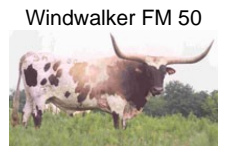
HORSE HEAD BOLD BEAUTY