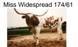
Horse Head Distinguished