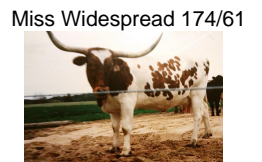
Horse Head Distinguished